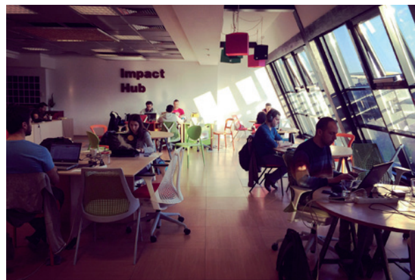
Impact Hub Budapest, Hungary