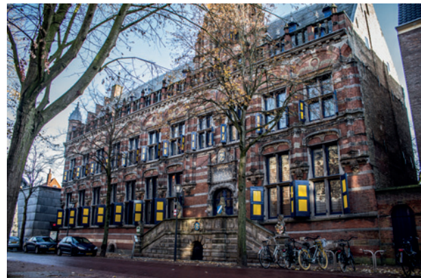
Stichting Business Development Friesland, Leeuwarden, The Netherlands (EBN Network)