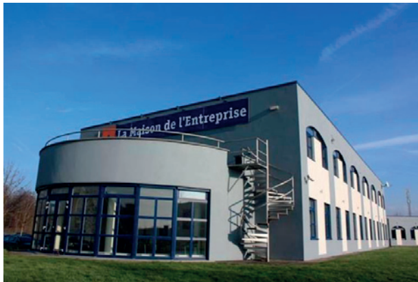
La Maison de l'Entreprise, Mons, Belgium (EBN Network)

An international community of smart & specialised organisations, that connect & coach innovators, entrepreneurs & SMEs, to start, grow & transform our economies